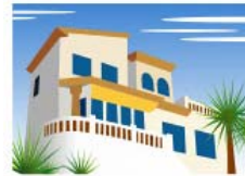
Country Sun holiday home