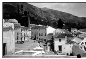
Some historic views of Casarabonela